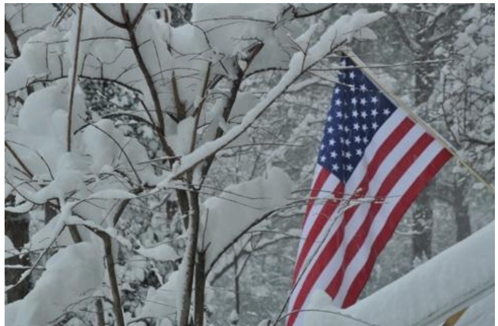
The National Colors fly amidst very atypical Hampton Roads weather the day after Christmas at Compatriot Elofson's home in Newport News.